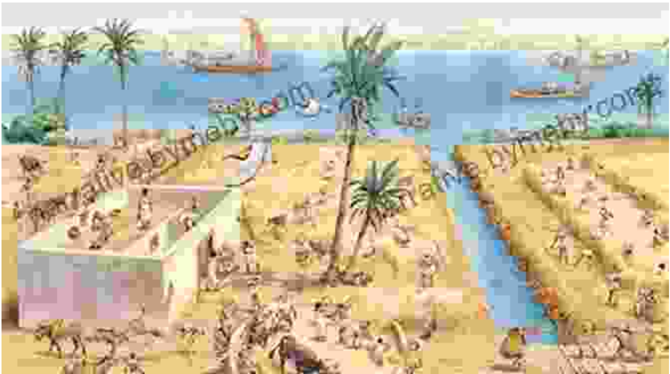
Ancient Egyptians using the Nile River

The Nile River has played a pivotal role in the development of human civilization. Ancient Egyptian societies flourished along the river's banks, establishing one of the world's earliest and most advanced civilizations. The Nile provided water for irrigation, transportation, and trade, and its fertile soil supported a flourishing agricultural system. The ancient Egyptians also developed a sophisticated system of water management, including dams, canals, and reservoirs, to control the river's flow and maximize its benefits.