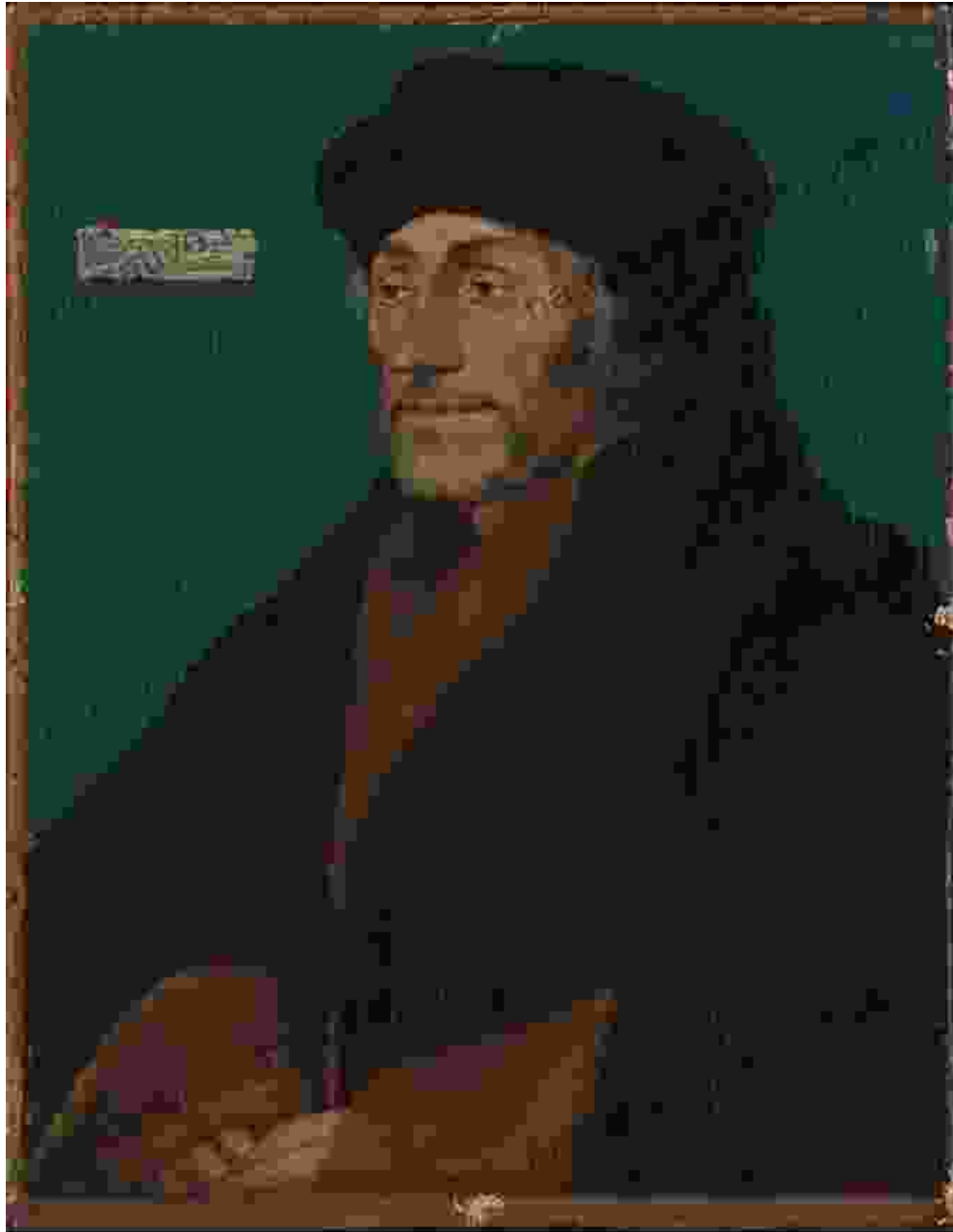
Portrait of Erasmus of Rotterdam (1523)

Witness the extraordinary likeness and psychological depth achieved in this portrait of the renowned humanist scholar, Erasmus of Rotterdam. Holbein's mastery of expression and detail brings to life the intelligence and character of one of the most influential figures of the Reformation.