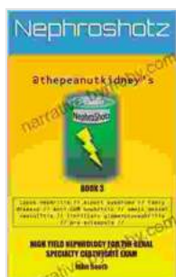
Image Alt Attribute: A book titled "High Yield Nephrology" on a desk surrounded by medical equipment and study materials.