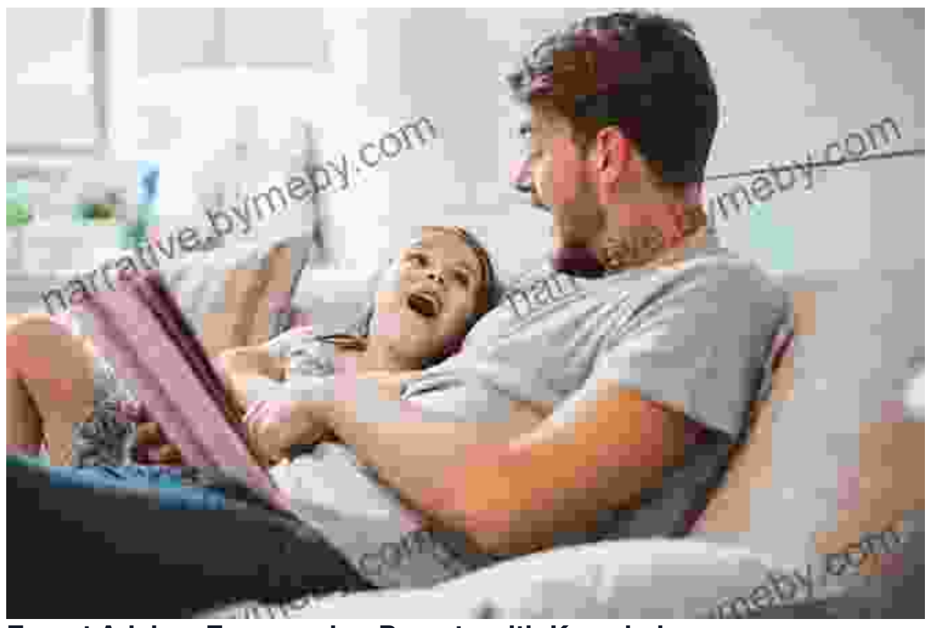
Expert Advice: Empowering Parents with Knowledge

decisions and feel confident in their parenting abilities.