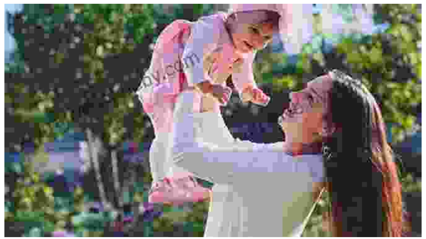
Heartwarming Anecdotes: A Window into the Shared Experience

perspectives, this book offers a comprehensive guide to help you navigate the complexities of raising a family.