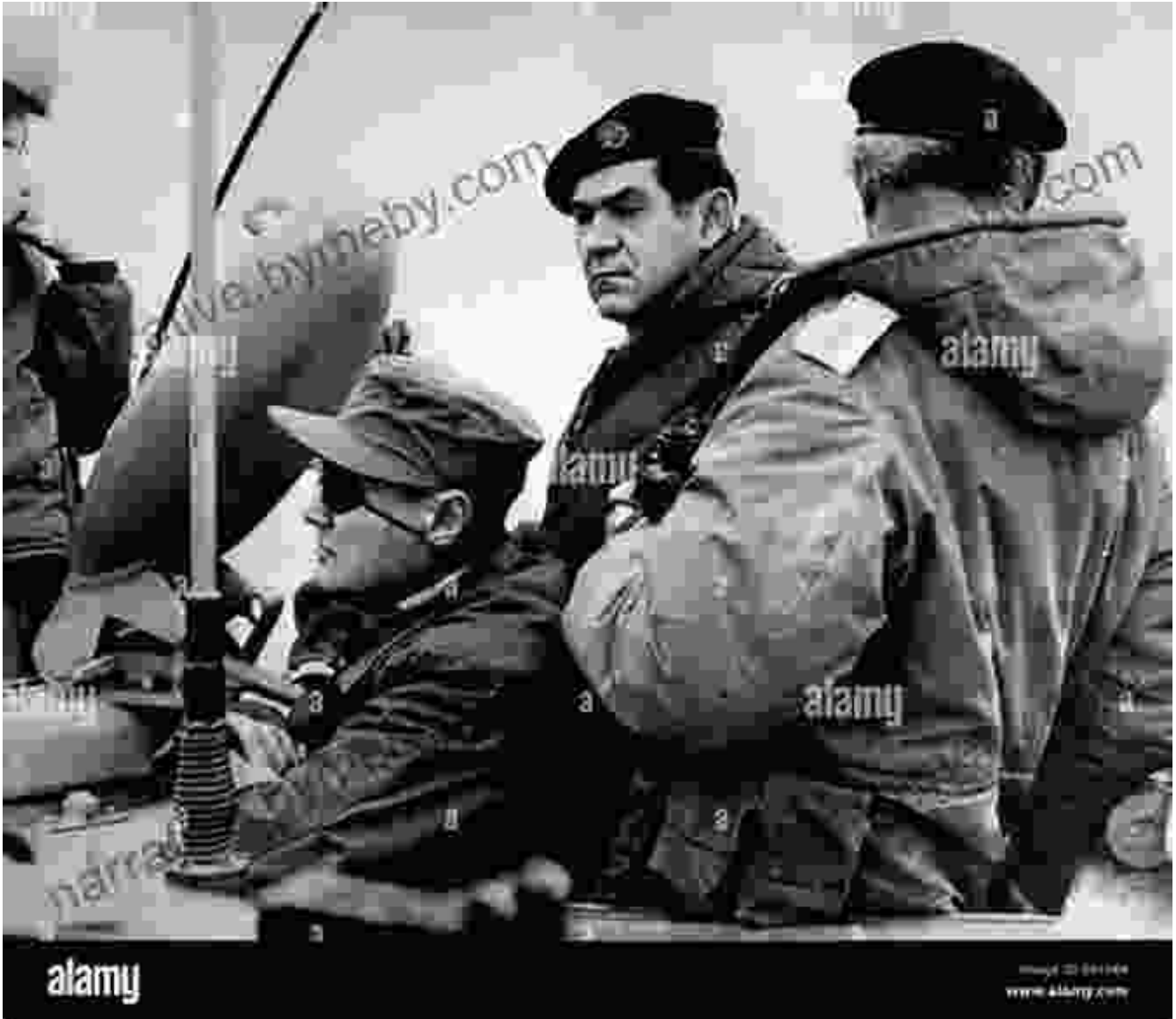
Moshe Dayan during the Suez Crisis, planning military operations.