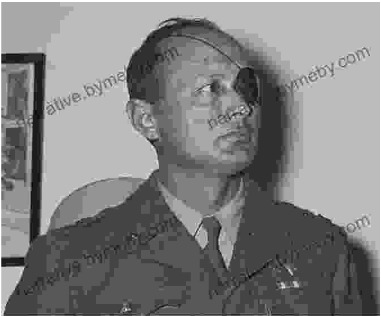
Moshe Dayan during his political career, meeting with foreign dignitaries.

Moshe Dayan passed away in 1981, leaving behind a complex and enduring legacy. He is remembered as a brilliant military strategist, a charismatic leader, and a visionary statesman. His legacy continues to inspire and divide, but there is no denying the profound impact he had on the fate of Israel and the Middle East.