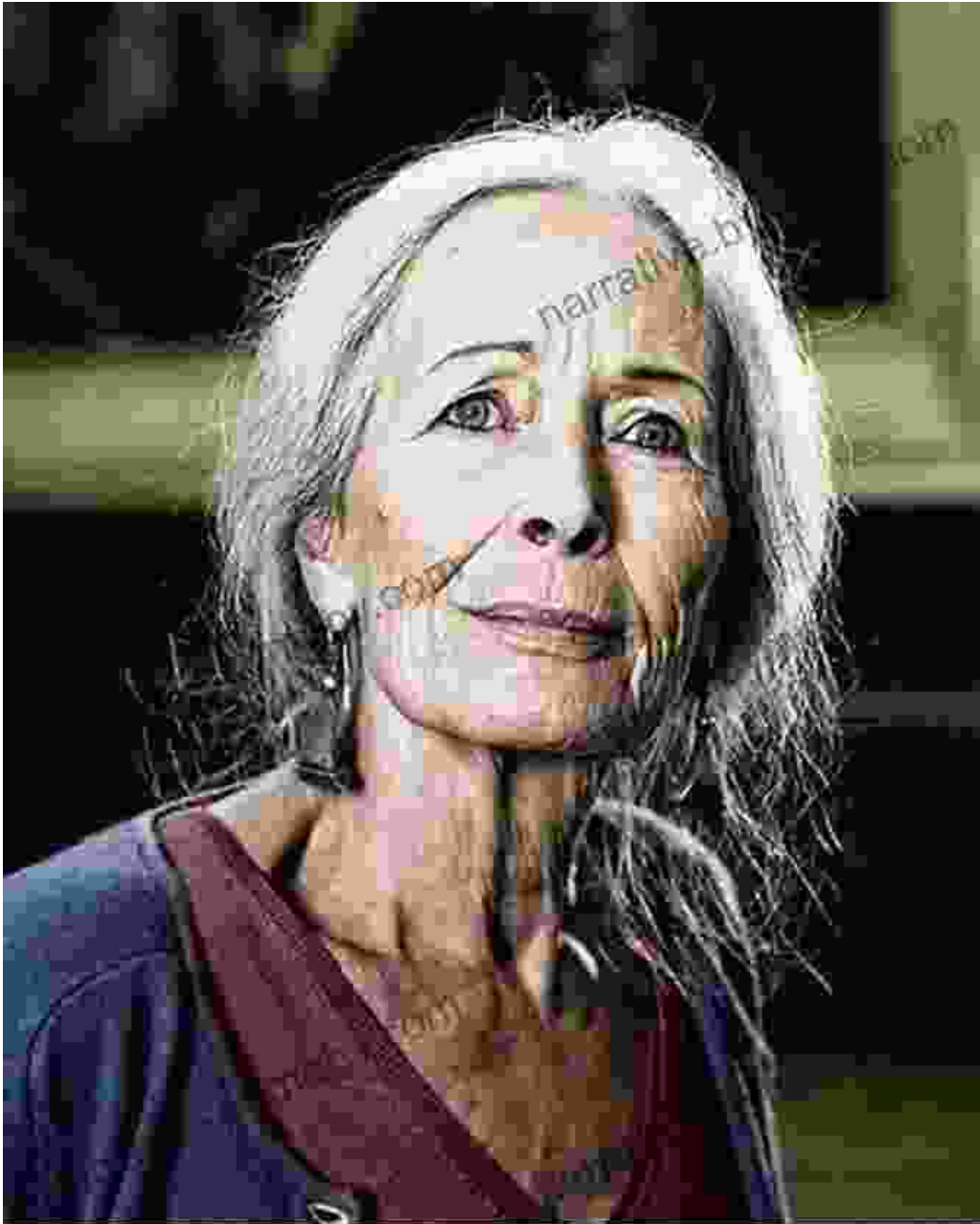
Gwen: A wise and gentle elder, Gwen holds the knowledge of ancient traditions and the power of the Eyes of Awen.