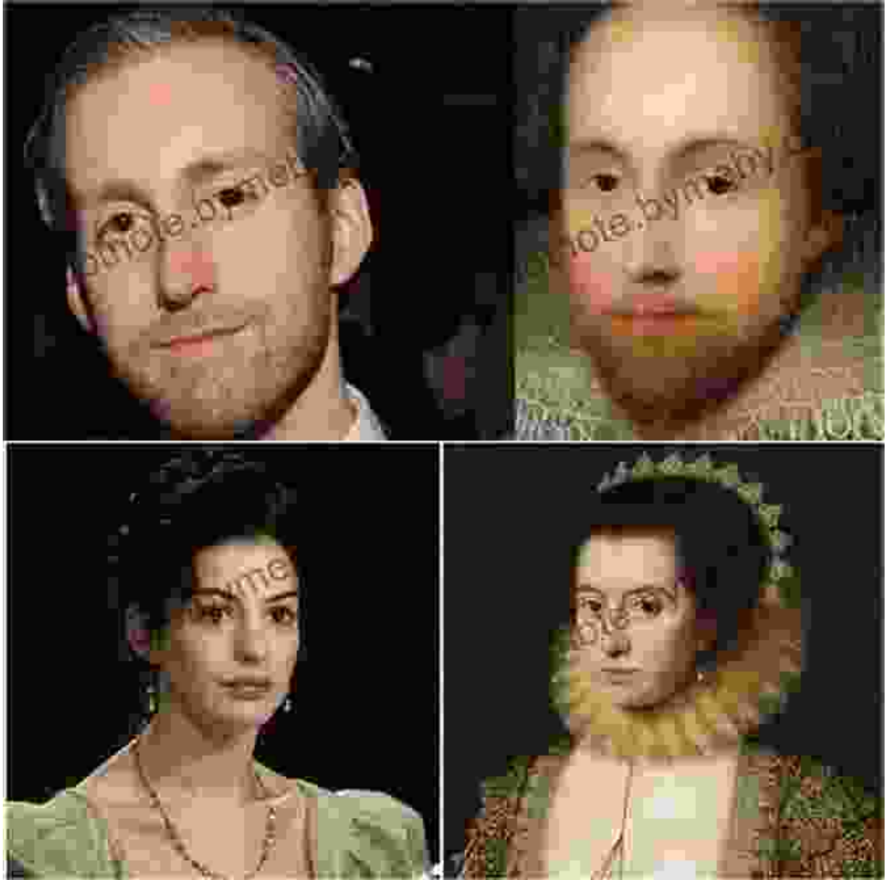
William Shakespeare and Anne Hathaway